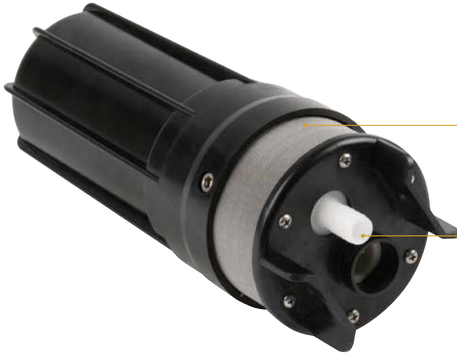
REMOTE WATER PUMP